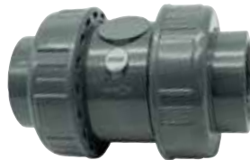
PVC-U check valve